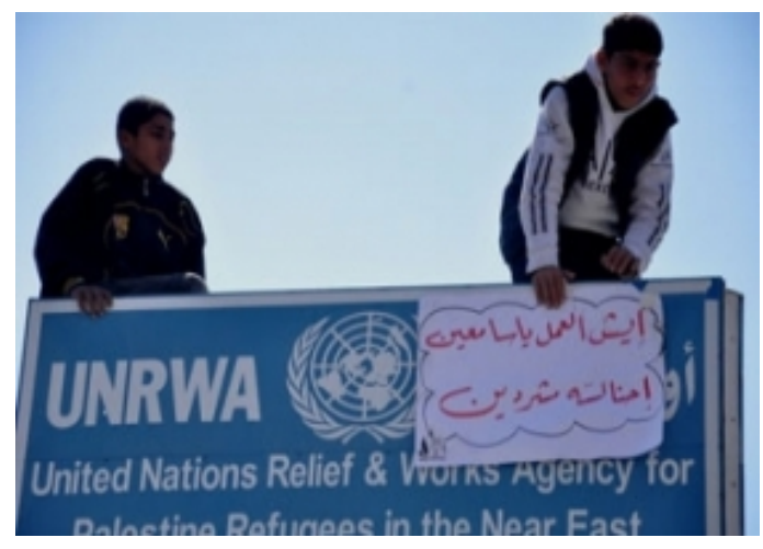
Palestinian protest in UNRWA